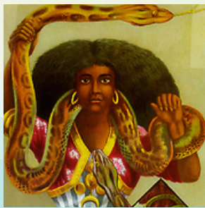
A painting of Mami Wata . Mami Wata is a water deity that can be found in religions and folklores across Africa and in the Caribbean. Her name reflects her status as "Mother of Water."