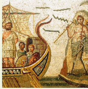
A mosaic of the Greek hero Odysseus meeting a siren . The Greeks originally described sirens as being part bird. Sirens were later described as half fish creatures or fully human in appearance.