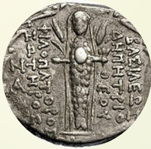
A coin featuring the ancient Syrian goddess Atargatis , who is represented as a figure with the head of a woman and the body of a fish.