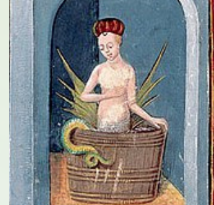
A painting of a Melusine , a figure in many European folklores. She can be found waiting in sacred springs or in rivers.