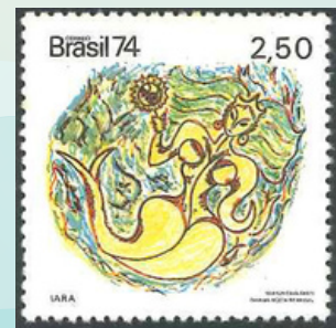
This stamp depicts Iara , a character from Brazilian folklore. She has green hair and the upper torso of a beautiful woman, and the tail of a river dolphin.