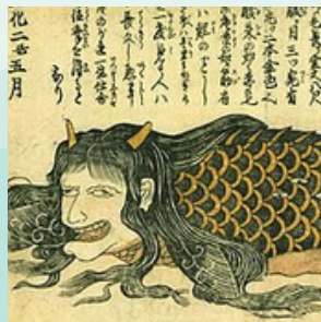
In Japanese folklore, the flesh of a Ningyo , a fish with the head of a human, could bestow long life on those who consumed it.