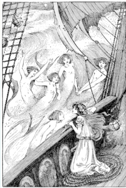
Ariel and her sisters in the original story of The Little Mermaid

Different myths involving mermaids and water spirits can be found in hundreds of countries all across the world. They date back as far as ancient Mesopotamia. One of the most famous examples of early mermaids are the ancient Greek sirens . The sirens are typically described as beautiful women who live in the sea and lure sailors to their deaths with their songs. The sirens are not the only example of mermaids, however. On the next page, there are several examples of mermaids and similar figures from all over the world!