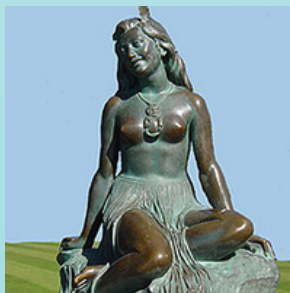
A statue of Pania , a figure from Māori mythology, who lives in the sea. In one myth, she fell in love with a human man who betrayed her trust, causing her to return to the sea forever.